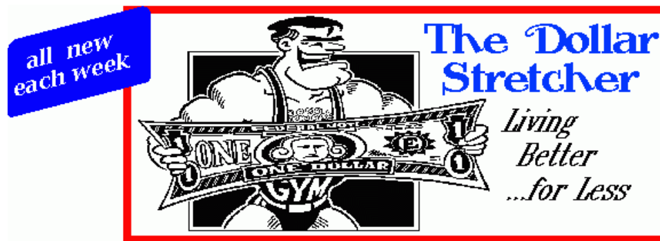
The Dollar Stretcher, Inc.

Remember that company that started out in a garage ?